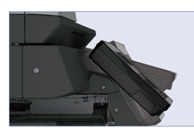
Pivoting Touchscreen offers the viewing angle for any use instantly.